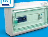
rECOBox 3 Air Curtain