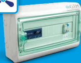
rECOBox 1 Ventilation