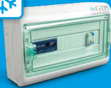
rECOBox 2 Air Conditioning