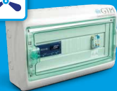
rECOBox 1 Ventilation