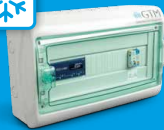
rECOBox 2 Air Conditioning